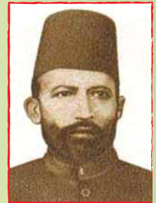
Hakim Ajmal Khan