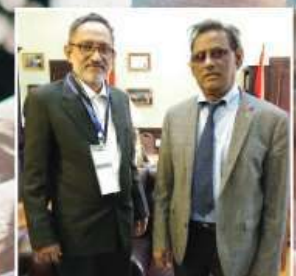
President of Mauritius & CMD of Impex Chamber