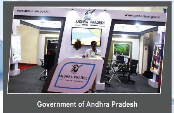
Government of Andhra Pradesh