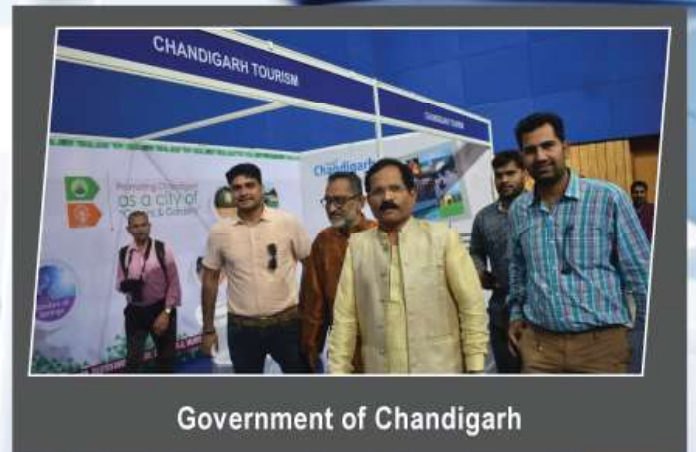
Government of Chandigarh