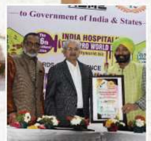
Impex Chamber, Mg. Director & Celebrity Chef with VIPs