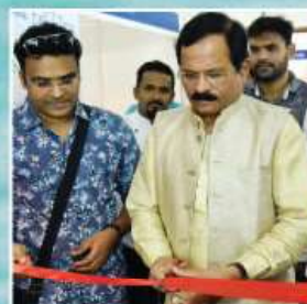
India's Minister Shripad & World Chef Varun Inamdar