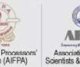
All India Food Processors' Association (AIFPA)