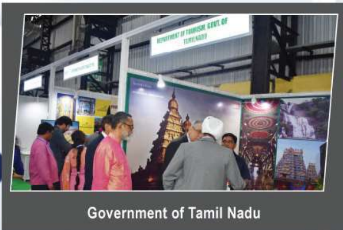
Government of Tamil Nadu