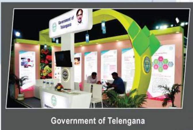
Government of Telangana