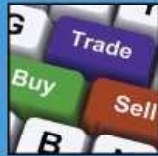
Associations & Chambers