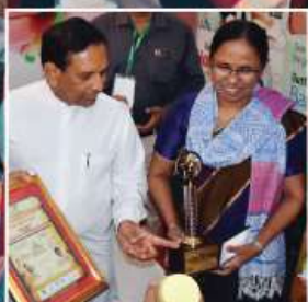
Sri Lankan Minister & Kerala Health Minister