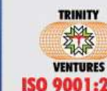
TRINITY VENTURES ISO 9001:2015