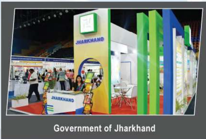
Government of Jharkhand