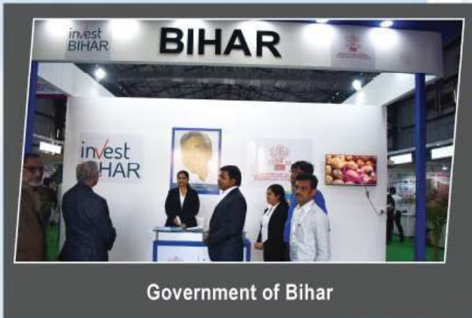
Government of Bihar