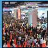
In Venue Displays