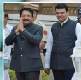
H. E. Governor Rao & CM Fadnavis of Maharashtra