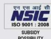
एन एस आई सी ISO 9001 : 2008 SUBSIDY POSSIBILITY