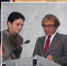
Mauritian Minister delivering the Keynote