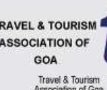
Travel & Tourism Association of Goa