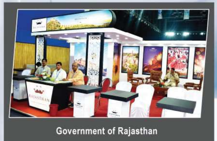
Government of Rajasthan