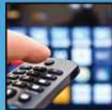
TV & Cable Channels