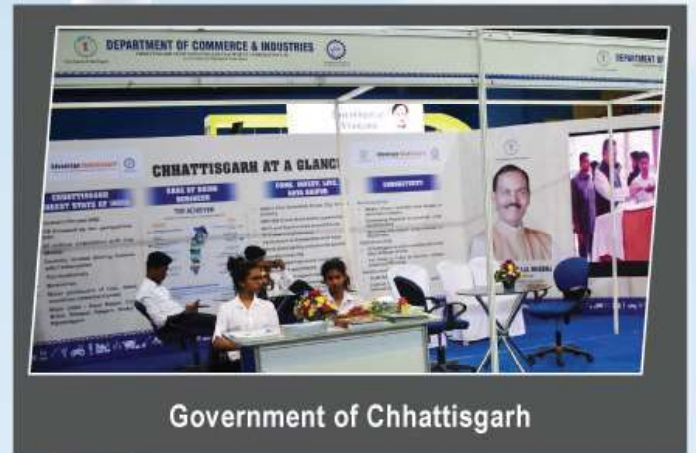
Government of Chhattisgarh