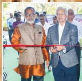
Maharashtra's Industries Minister inaugurating