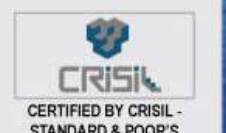
CERTIFIED BY CRISIL - STANDARD & POOR'S