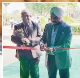
Hotels & Restaurants Association President