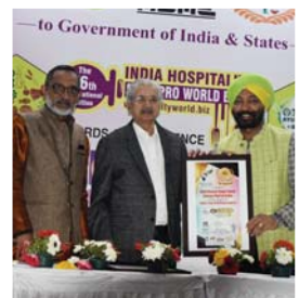
Impex Chamber, MD & Celebrity Chef with VIPs