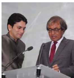
Mauritian Minister delivering the Keynote