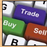
Associations & Chambers