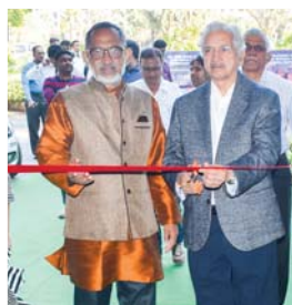
Maharashtra's Industries Minister inaugurating