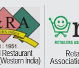
Hotel And Restaurant Association (Western India)