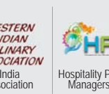
Western India Culinary Association