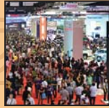
In Venue Displays