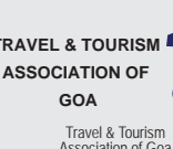
Travel & Tourism Association of Goa