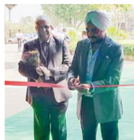
Hotels & Restaurants Association President