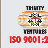
TRINITY VENTURES ISO 9001:2015