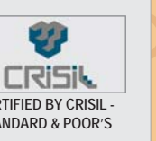
CERTIFIED BY CRISIL - STANDARD & POOR'S

www.bakerysnacks.com +91 9769555657 / 9930308479 trinity.cmd@gmail.com