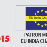
PATRON MEMBER EU INDIA CHAMBERS