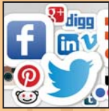
Social Media & Telecom