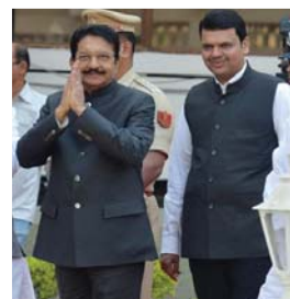
H. E. Governor Rao & CM Fadnavis of Maharashtra