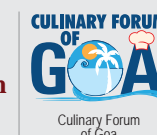
Culinary Forum of Goa