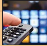
TV & Cable Channels