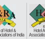
Federation of Hotel & Restaurant Associations of India