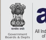
Government Boards & Depts