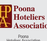
Poona Hoteliers Association