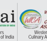
Retailers Association of India