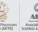
All India Food Processors' Association (AIFFPA)