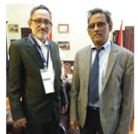
President of Mauritius & CMD of Impex Chamber