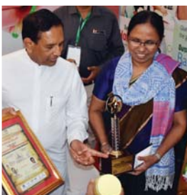
Sri Lankan Minister & Kerala Health Minister