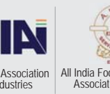
All India Association of Industries