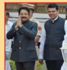
H. E. Governor Rao & CM Fadnavis of Maharashtra