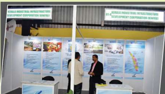
Kerala Industrial Infra. Dev. Corp. (KINFRA) Dept of Industries, Government of Kerala