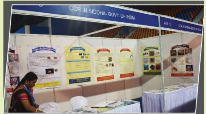
Central Council for Research in Siddha Medicine - CCRS