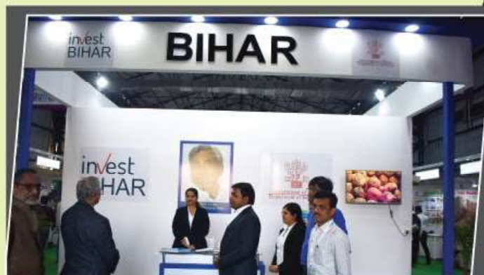
Government of Bihar