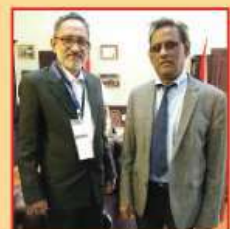
President of Mauritius & CMD of Impex Chamber