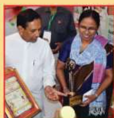
Sri Lankan Minister & Kerala Health Minister