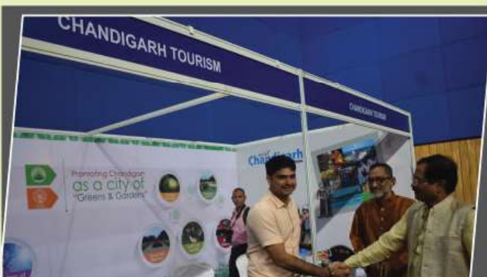
Union Territory of Chandigarh