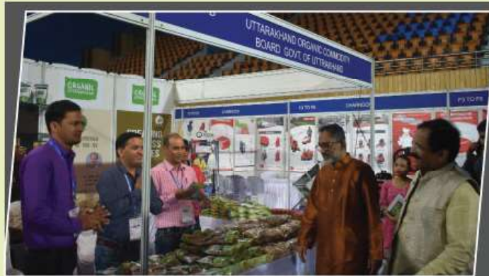
Uttarakhand Organic Commodity Board Dept of Agriculture, Govt of Uttarakhand