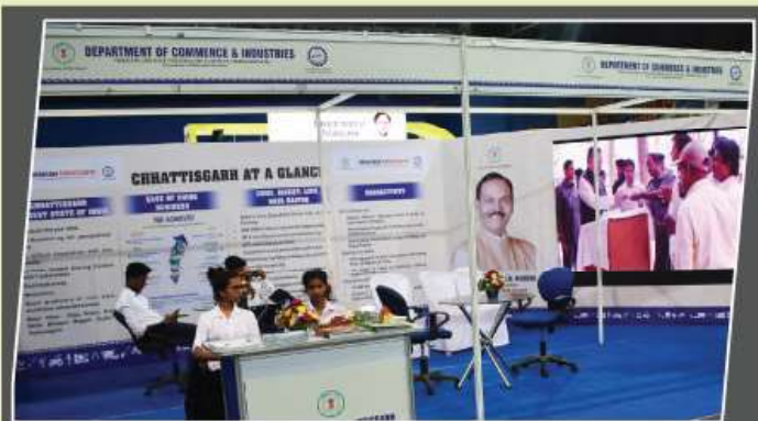
Department of Industries Government of Chhattisgarh