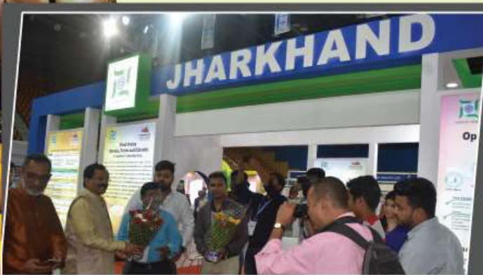
Department of Industries Government of Jharkhand