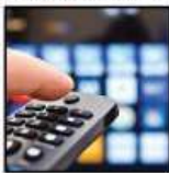
TV & Cable Channels