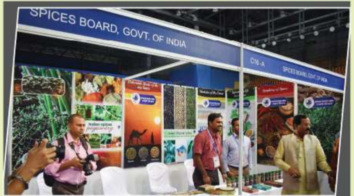
Spices Board, Government of India Ministry of Industry & Commerce