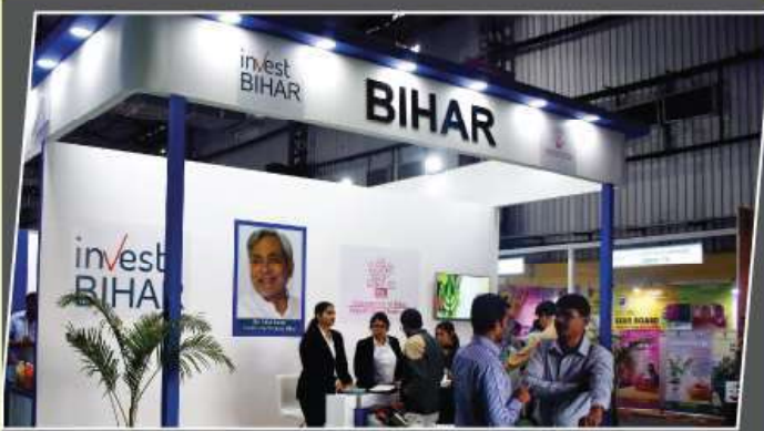
Department of Industries Government of Bihar