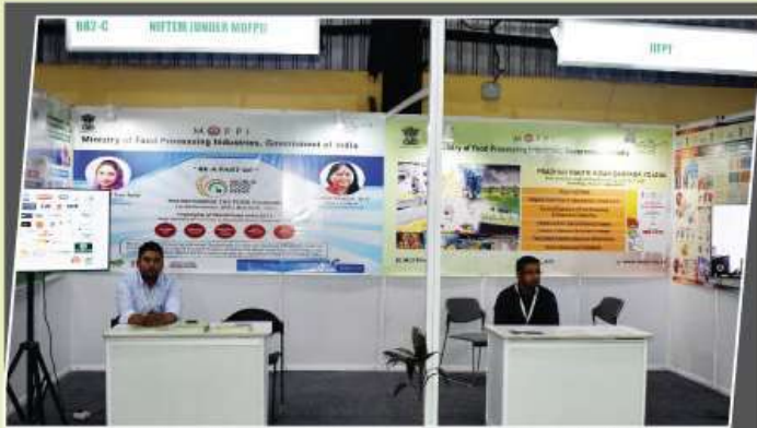
NIFTEM & IIFPT, Government of India, Ministry of Food Processing Industries