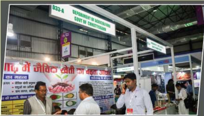
Department of Agriculture Government of Chhattisgarh