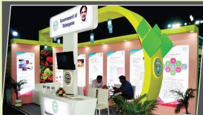
Department of Industries Government of Telangana