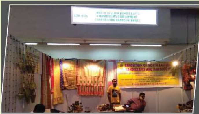
North Eastern Handicrafts & Handlooms Dev. Corp. Board, Ministry of DoNER