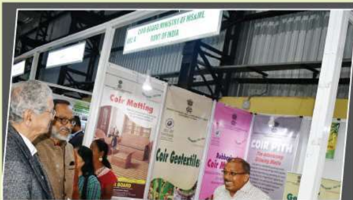
Coir Board of India, Ministry of MSME, Government of India