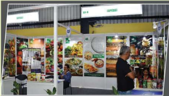
APEDA Pavilion - Agricultural Products Export Dev. Authority, Ministry of Industry & Commerce