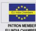
PATRON MEMBER EU INDIA CHAMBERS