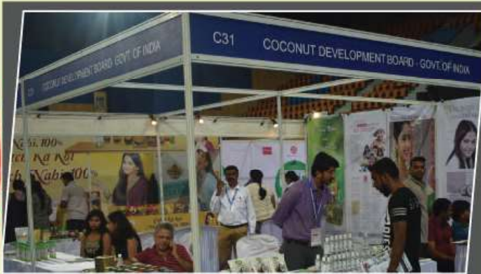
Coconut Development Board, Govt of India Ministry of Agriculture