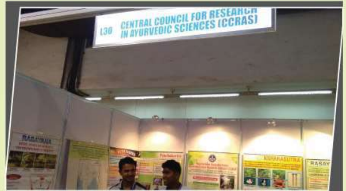
Central Council for Research in Ayurvedic Sciences - CCRAS