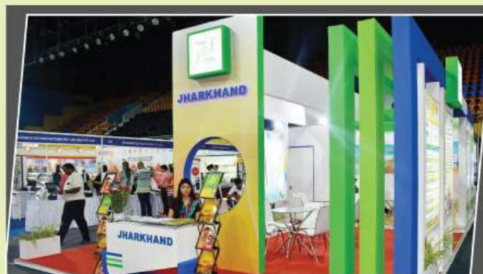
Government of Jharkhand