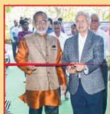
Maharashtra's Industries Minister inaugurating