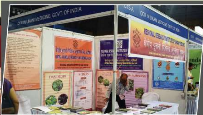
Central Council for Research in Unani Medicine - CCRUM