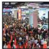
In Venue Displays