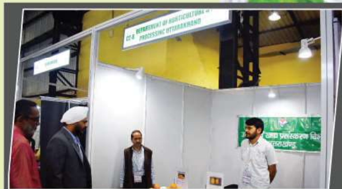
Department of Horticulture Government of Uttarakhand