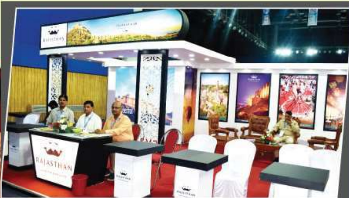
Government of Rajasthan