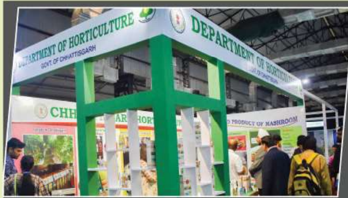
Department of Horticulture Government of Chhattisgarh