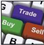
Associations & Chambers