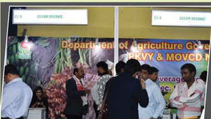
Department of Agriculture - PKVY & MOVCD Government of Assam