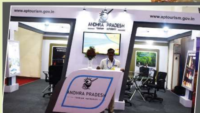
Government of Andhra Pradesh