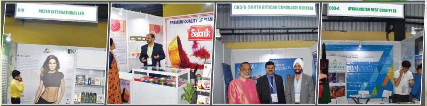
Foreign Government Pavilions & Companies from Hong Kong, South Africa, Afghanistan, Europe, China, Iran, etc. were represented