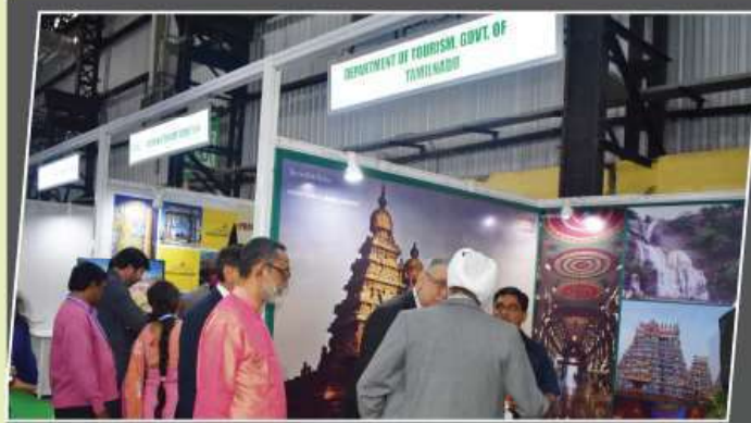
Government of Tamil Nadu