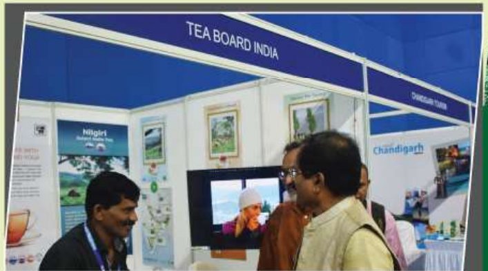
Tea Board, Government of India Ministry of Industry & Commerce