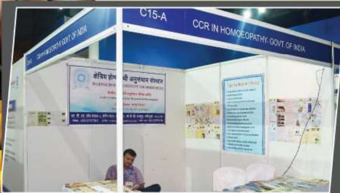
Central Council for Research in Homoeopathy - CCRH