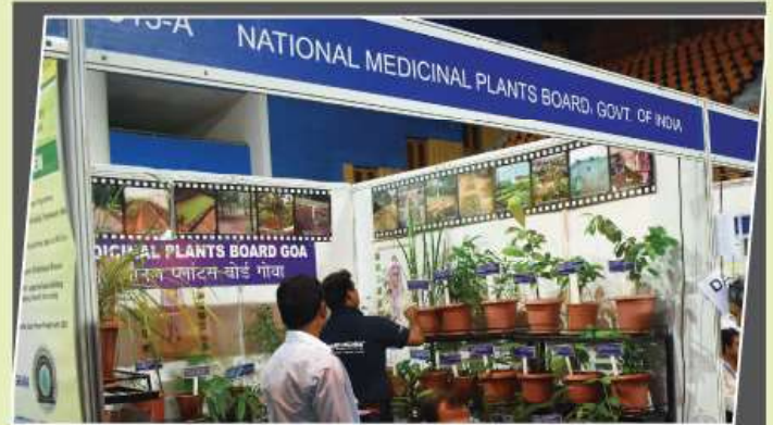
National Medicinal Plants Board of India - NMPB