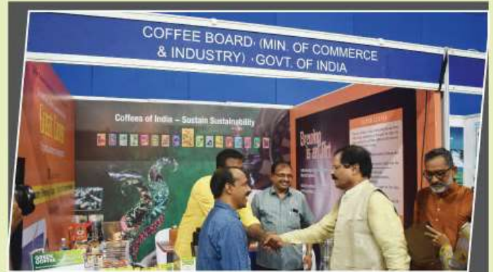
Coffee Board, Government of India Ministry of Industry & Commerce