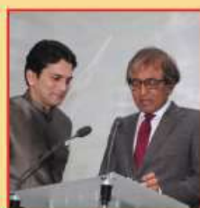
Mauritian Minister delivering the Keynote