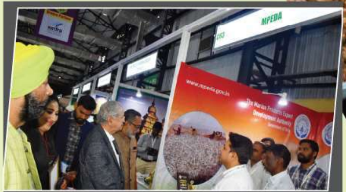
MPEDA Pavilion - Marine Products Export Dev. Authority, Ministry of Industry & Commerce