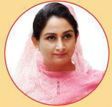
Smt. Harsimrat Kaur Badal, Union Minister of Food Processing

We are back for the 16th year in succession. F & B Pro India has over the last so many editions featured a number of Government of India boards, like those for Coir, Jute, Coffee, Coconut, etc. besides being supported by the Union Ministry of Food Processing Industries and chambers of commerce, professional / industry / trade associations, newspapers and publications. According to McKinsey & Co, the food retail sector in India is likely to grow to US $ 150 Billion by 2025, accounting for a large chunk of the world food industry, estimated to be US $ 400 Billion by then. All of which makes being at F & B Pro India - an absolute imperative.