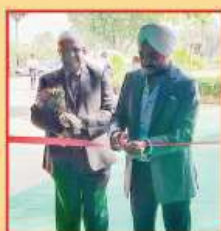
Hotels & Restaurants Association President