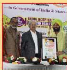
Impex Chamber MD & Celebrity Chef with VIPs